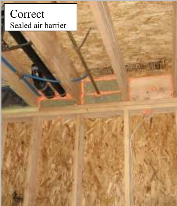
Correct Sealed air barrier